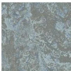
132-054 Ice Blue