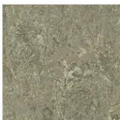
132-053 Flint Grey