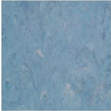
dusty blue NCS: S 4020-R90B