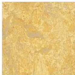
132-040 Light Desert