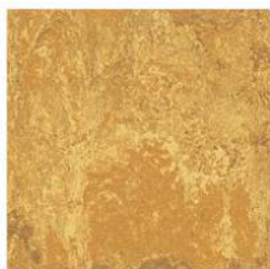
132-042 Light Oak