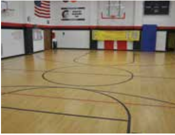
Authentic wood appearance suitable for sports halls & multi purpose functions.

Connor Sports • 800.283.9522 • 847.290.9020 • info@connorsports.com • connorsports.com/resilient