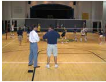
Consistent performance for daily sports activities and community events.