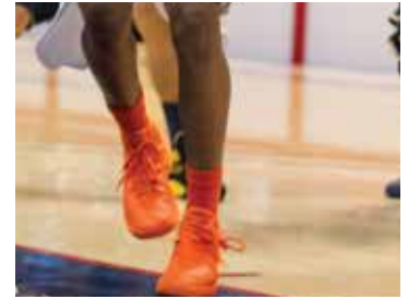
Engineered to reduce fatigue, absorb shock and boost performance.