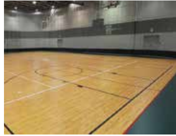
Use colors for keys & borders to enhance the visual aspect of your new sports venue.